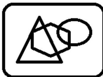
Fig. 1. Title of the figure

Tables, figures, diagrams should have numbers and titles (300 dpi in tif или jpg format):